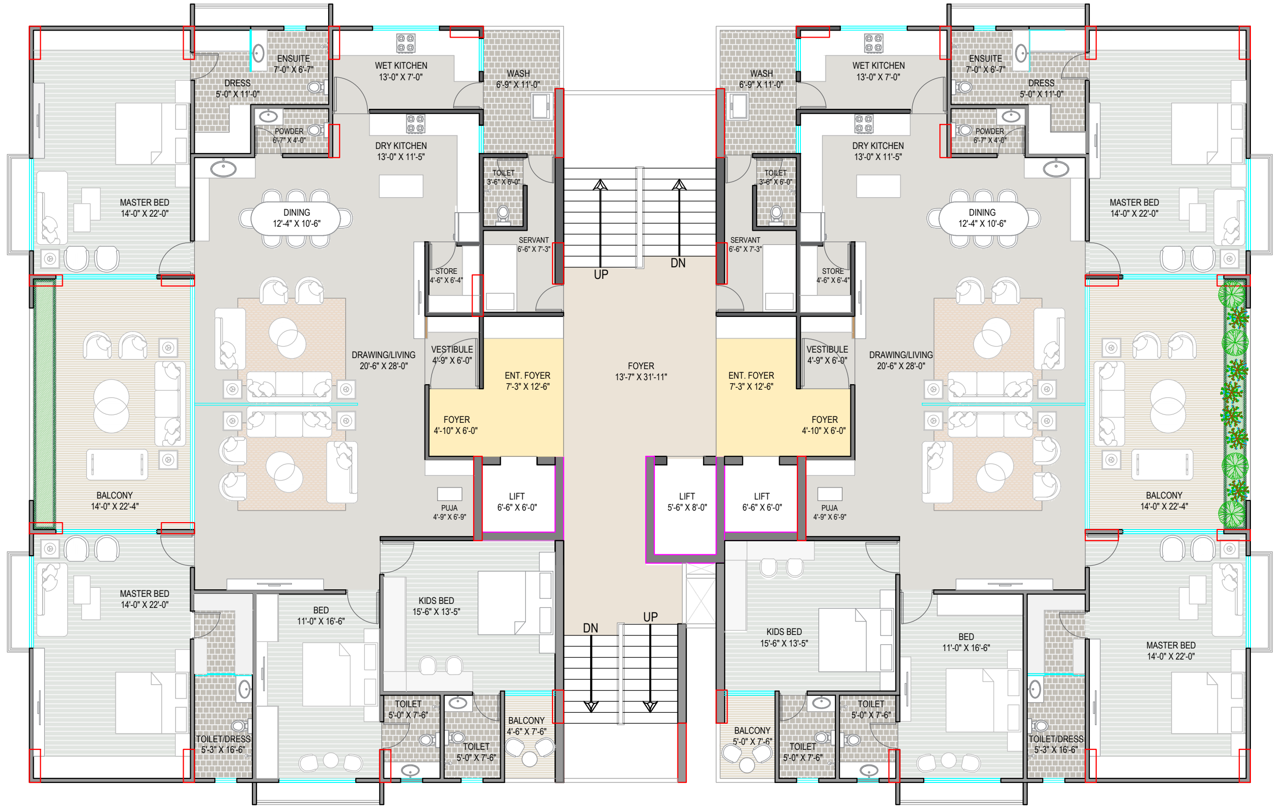
TYPICAL FLOOR PLAN UNIT B AREA - 283.55 SQ.MTS.